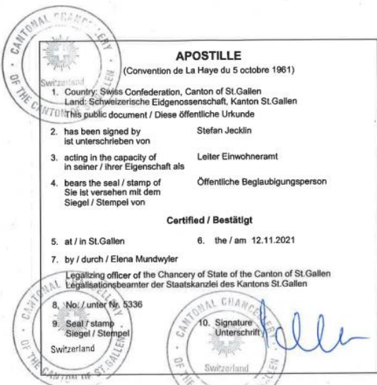
(Legalized by Korean Embassy)