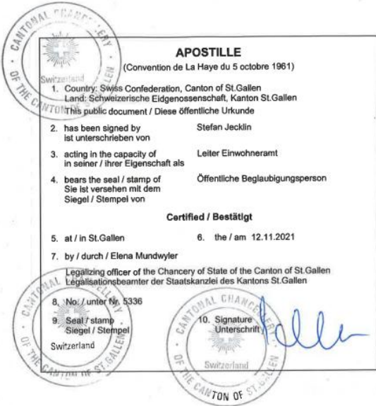
(Legalized by Korean Embassy)